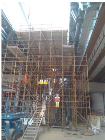
Traditional method using scaffold to inspect